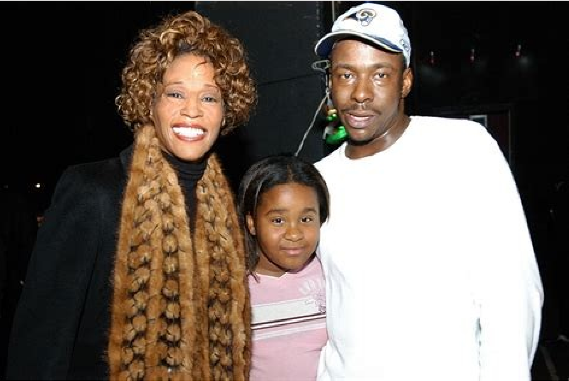
Bobby brown song lyrics every little step.